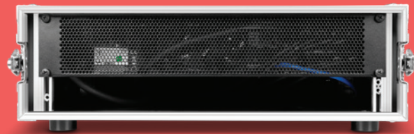
DSP 44 K RACK PROFESSIONAL DSP POWER AMPLIFIER WITH DANTE™ INTERFACE