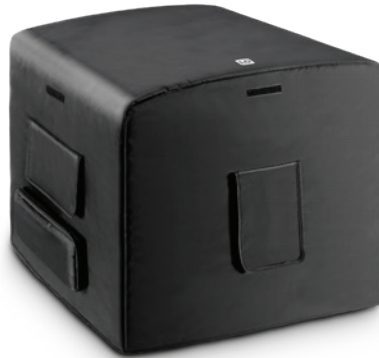
STINGER SUB 18 G3 PC LDESUB18G3PC PROTECTIVE COVER FOR STINGER SUB 18"