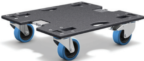
STINGER SUB 15 G3 CB LDESUB15G3CB CASTOR BOARD FOR STINGER SUB 15"