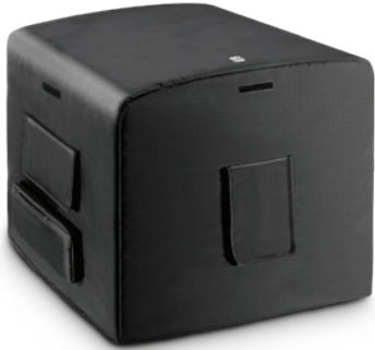
STINGER SUB 15 G3 PC LDESUB15G3PC PROTECTIVE COVER FOR STINGER SUB 15"