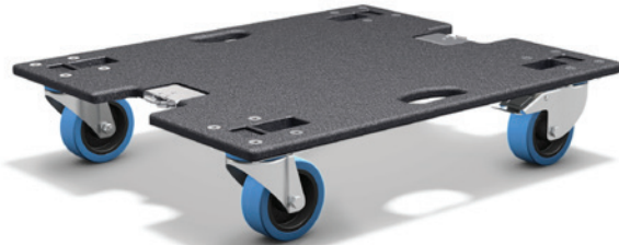
STINGER SUB 18 G3 CB LDESUB18G3CB CASTOR BOARD FOR STINGER SUB 18"